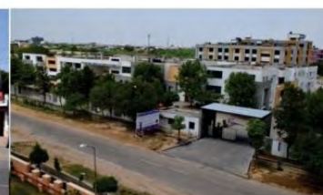
Poornima Group of Institutions