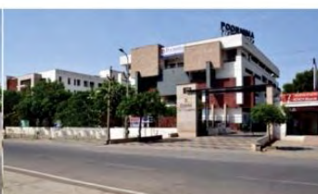
Poornima Institute of Engineering & Technology