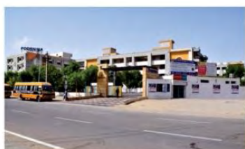
Poornima College of Engineering

At Poornima, emphasis is given to transparent working systems, responsibility sharing at all levels and distribution & execution of work through smaller groups.