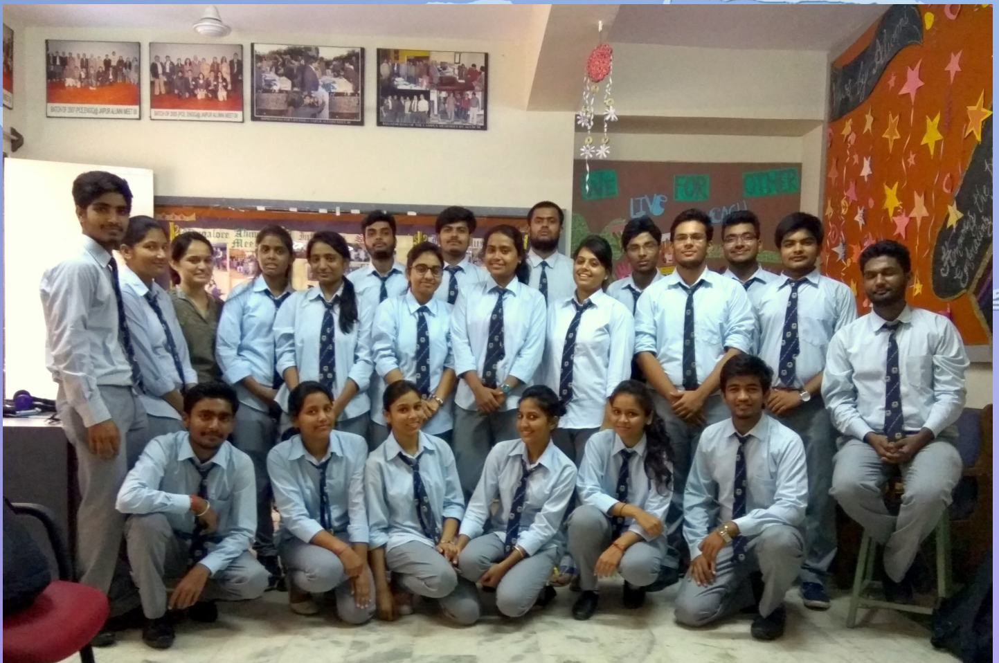
Poornima Alumni Association Coordinators