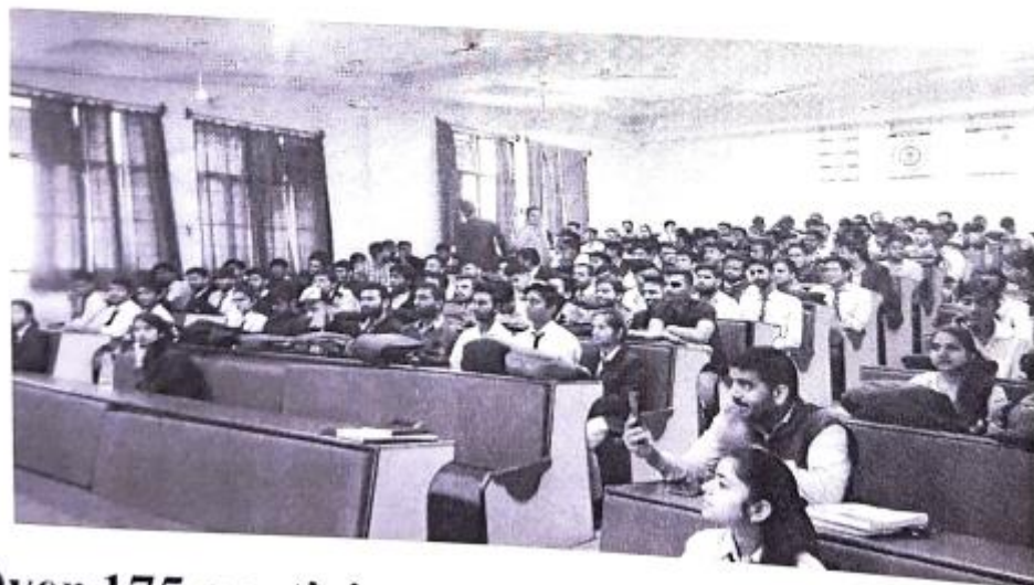
Over 175 students