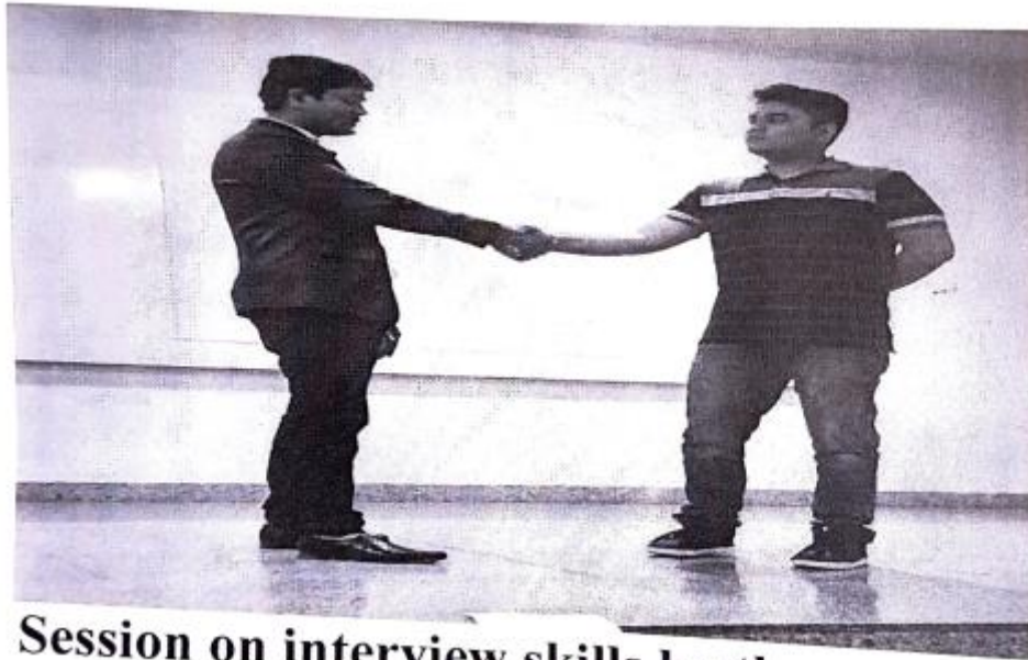
Session on interview skills